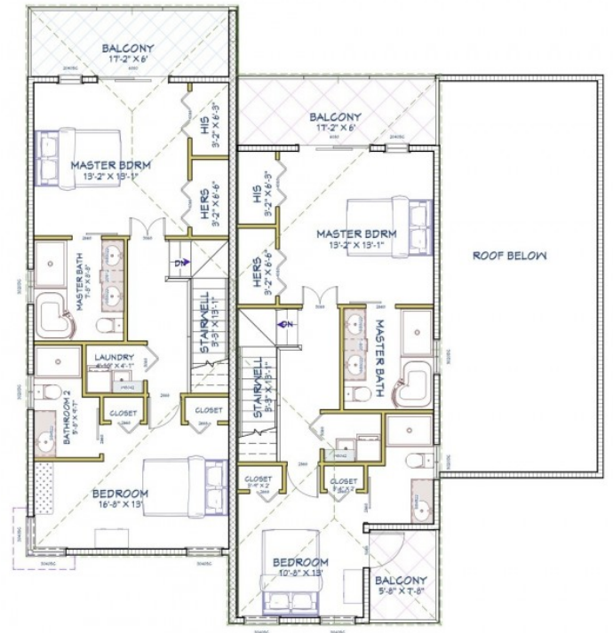
LIVING AREA 1210 SQ FT