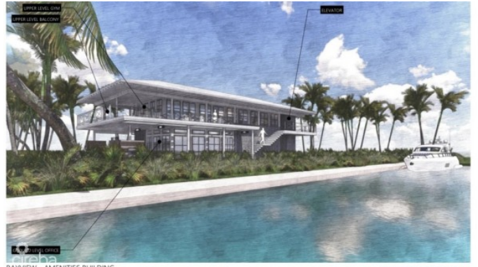
BAYVIEW - AMENITIES BUILDING