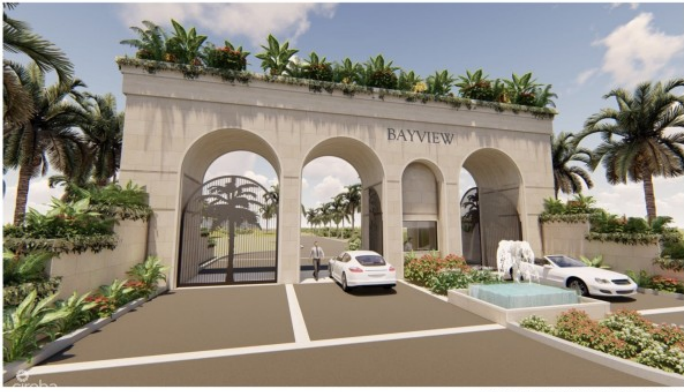
3D VIEW 2 - SECURITY / GATEHOUSE